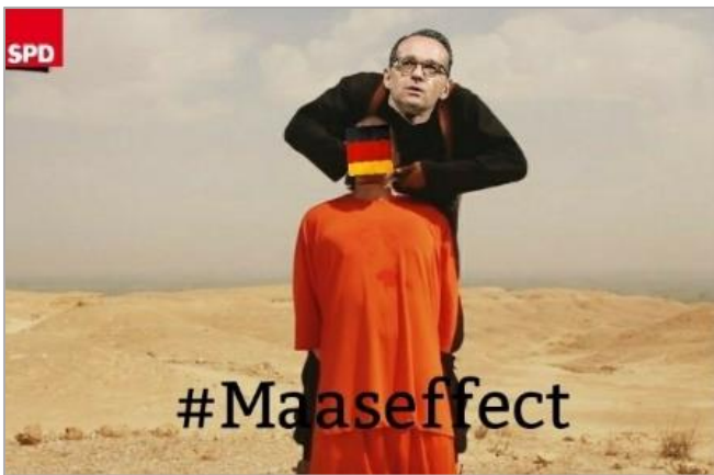
Provocative memes: Segment from an Islamist execution video as an anti-democratic photo collage serves as input into debates.

Specifically Twitter – not least because of the character limit for Tweets – is a platform for disseminating images and memes typical for the extremist scene as condensed content. Here, graphic depictions of internet culture like the comic character 'Pepe the Frog' as well as popular films and series serve as a basis; but also contemporary iconography is modified for disseminating the Identitarians' own propaganda.